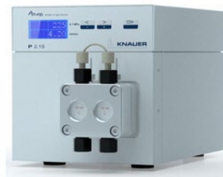
AZURA P 2.1S pump

With its small footprint, the compact dual-piston pump AZURA P 2.1S can be used for many different laboratory tasks. A pressure rating of up to 400 bar and chemical resistance to a wide range of eluents make it the perfect choice for LC and dosing applications. Pump heads with maximum flow rates of 10 and 50 ml/min are available.