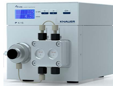
AZURA P 4.1S pump with pressure sensor

Moreover – the exchangeable pump head allows adaptation of the pump for delivery of aggressive media and bioinert applications. The pump head can also be heated or cooled with optional accessories.