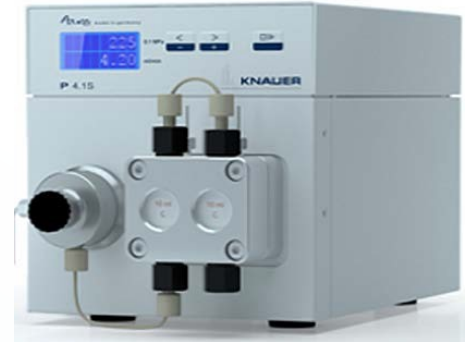
AZURA P 4.1S pump with pressure sensor

Moreover – the exchangeable pump head allows adaptation of the pump for delivery of aggressive media and bioinert applications. The pump head can also be heated or cooled with optional accessories.