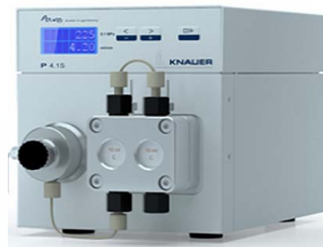
AZURA P 4.1S pump with pressure sensor

Moreover – the exchangeable pump head allows adaptation of the pump for delivery of aggressive media and bioinert applications. The pump head can also be heated or cooled with optional accessories.